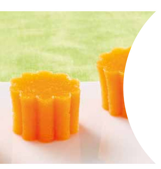
Put time on your side