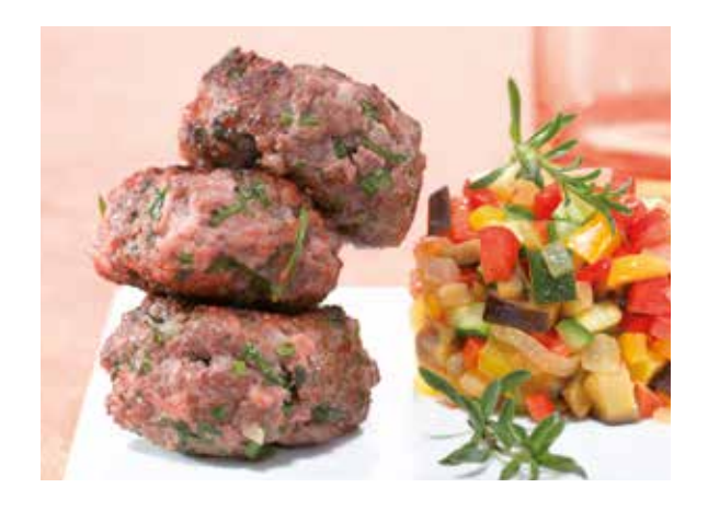
Less than 2 minutes to grind 2.5 kg of meat!

The Cutter Mixer, the chef's ideal assistant, grinds, kneads, emulsifies and chops to prepare healthy, delicious, house-made mains and desserts.