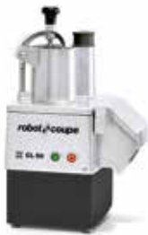
Vegetable preparation machines