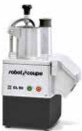
Vegetable preparation machines